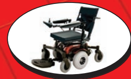
Many seating options available